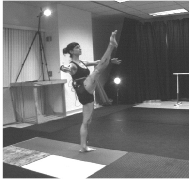
Figure 1: Dancer doing grand battement devant, in live time